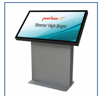
Shown with Xtreme™ Outdoor Landscape Kiosk, KOL555(-S)-XHB