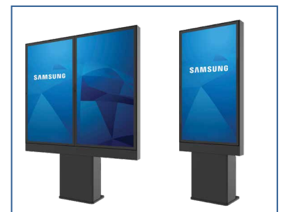
Peerless-AV® Outdoor Digital Menu Boards are also available with one or two displays.