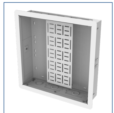
Shown with 14 x 14" In-Wall Box (IB14X14-W)