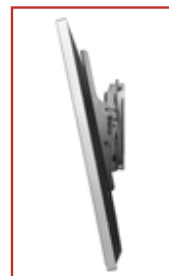
+15°/-5° of tilt for versatile viewing angles