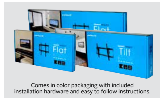
Comes in color packaging with included installation hardware and easy to follow instructions.